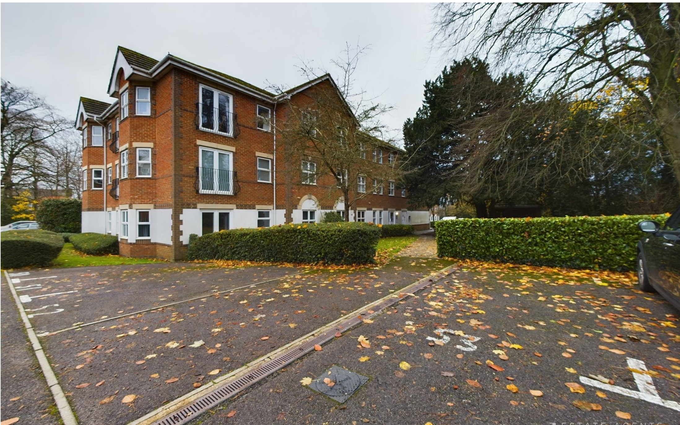
Regent Court, Norn Hill, Basingstoke, RG21 4HP